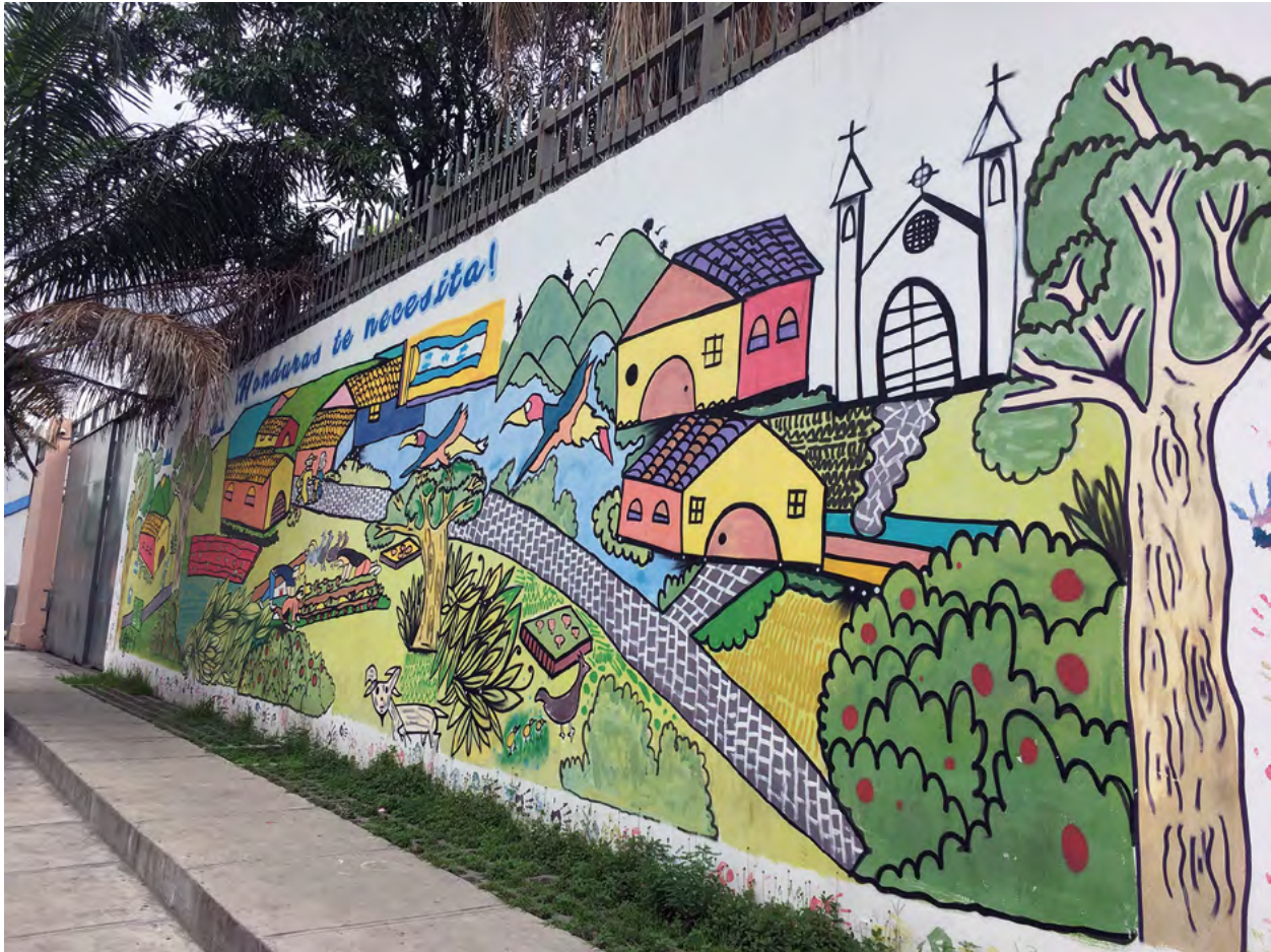
A mural outside the Belén Center with the message "Honduras needs you!".

mental health services, education, technical training and social protection programs, including food vouchers and micro-credit. Reintegration services are embedded into programming for all children in a community – an approach that reduces potential stigmatization of returning children, while also addressing root causes that drive forced migration.