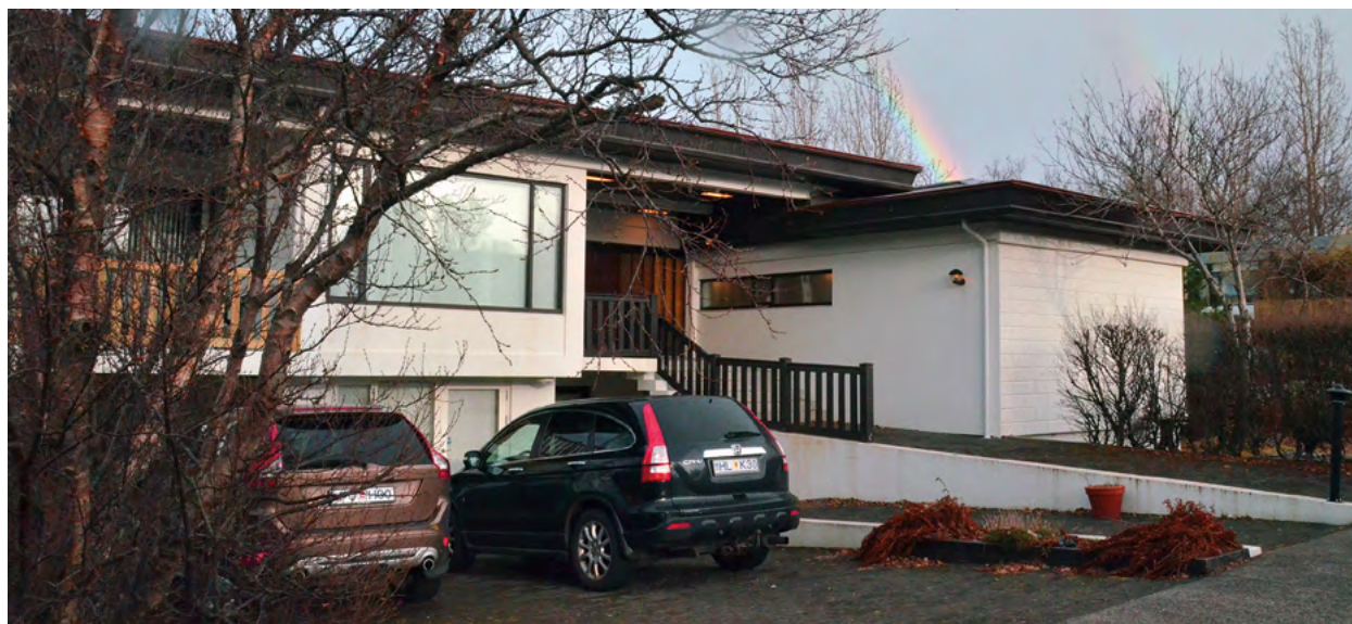
The Barnahus reception model in Iceland and in many other countries across Europe offers a child-friendly environment in a residential neighborhood.

ORR is an office under the umbrella of HHS/ACF, a division charged with delivering a wide range of services focused on the well-being of children, families, individuals and communities, from childcare to child abuse prevention. Within ACF, ORR helps new arrivals integrate in the United States through the U.S. Refugee Resettlement Program, and provides care and services for children through the Unaccompanied Refugee Minors (URM) program and the Unaccompanied Alien Children (UAC) program. 36 In addition, ORR is responsible for migrant children who, for other reasons, have been separated from their parents or legal guardians. 37