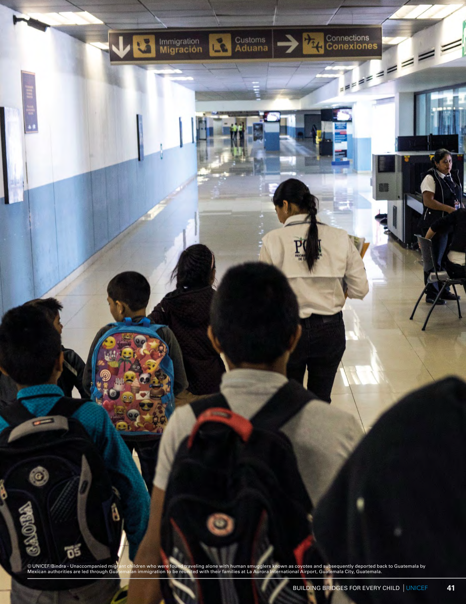
Unaccompanied migrant children who were found traveling alone with human smugglers known as coyotes and subsequently deported back to Guatemala by Mexican authorities are led through Guatemalan immigration to be reunited with their families at La Aurora International Airport, Guatemala City, Guatemala.