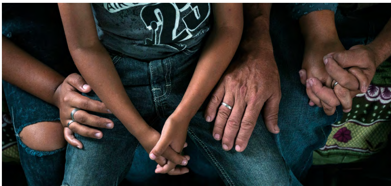
Ensuring children's best interests.

The child's best interests should be the primary consideration in all actions concerning children, whether undertaken by public or private social welfare institutions, courts of law, administrative authorities or legislative bodies. 105 In child-sensitive reception systems, trained, independent guardians or advocates should assess, support and represent the child's best interests, ensure quality of care, advocate for improvements where needed, and facilitate access to legal protection and social services. Although many countries incorporate best interests determination (BID) procedures in asylum or related processes, the influence that the BID carries in decisions concerning children is inconsistent.