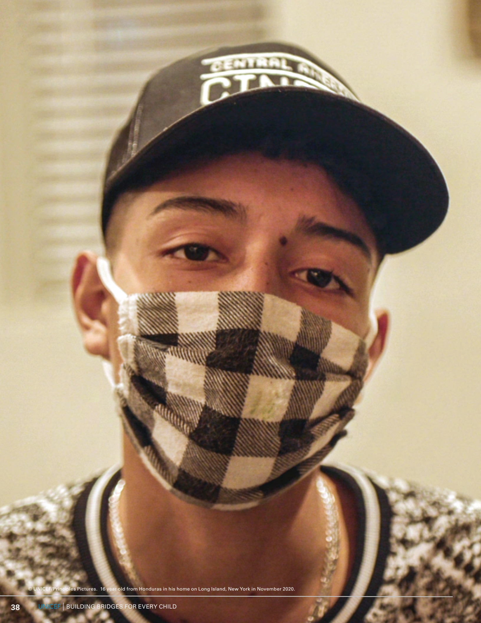
16 year old from Honduras in his home on Long Island, New York in November 2020.