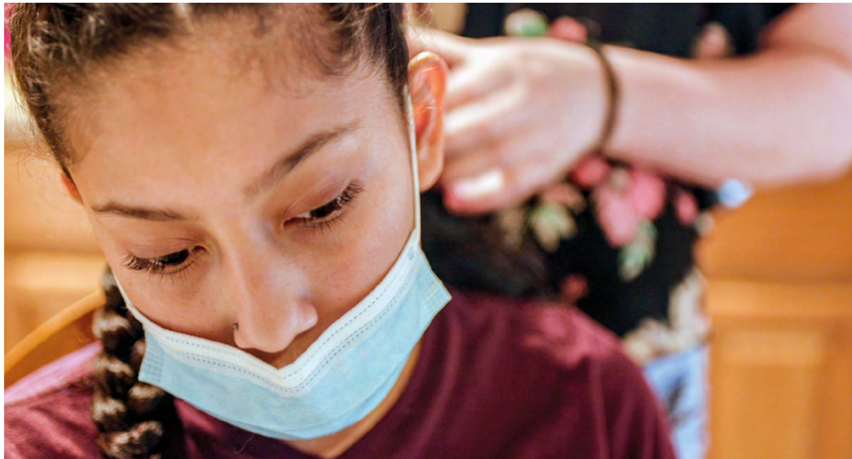
A girl (age 14) from Guatemala gets her hair braided by her sister at their home on Long Island, New York (2020).