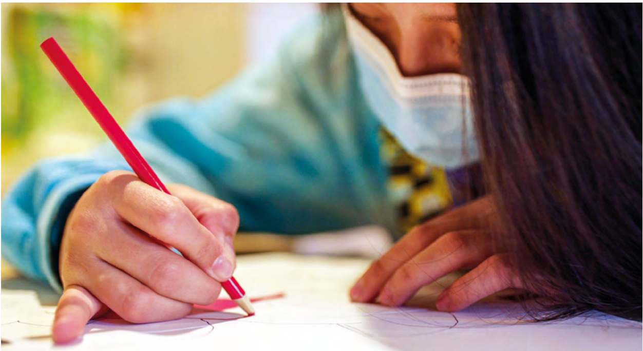
A girl (age 15) drawing at her home on Long Island, NY (2020).