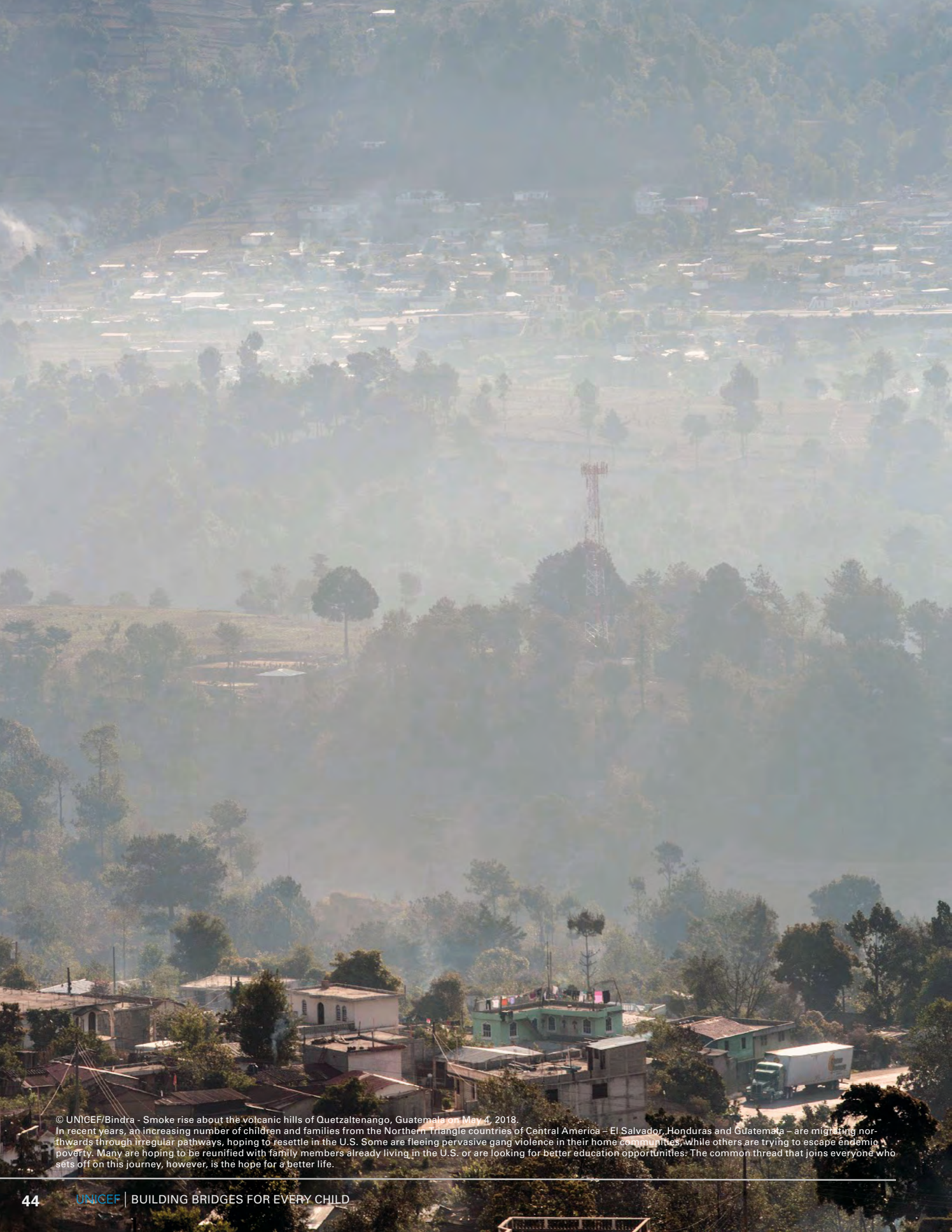
Smoke rise about the volcanic hills of Quetzaltenango, Guatemala on May 4, 2018.

In recent years, an increasing number of children and families from the Northern Triangle countries of Central America – El Salvador, Honduras and Guatemala – are migrating northwards through irregular pathways, hoping to resettle in the U.S. Some are fleeing pervasive gang violence in their home communities, while others are trying to escape endemic poverty. Many are hoping to be reunified with family members already living in the U.S. or are looking for better education opportunities. The common thread that joins everyone who sets off on this journey, however, is the hope for a better life.