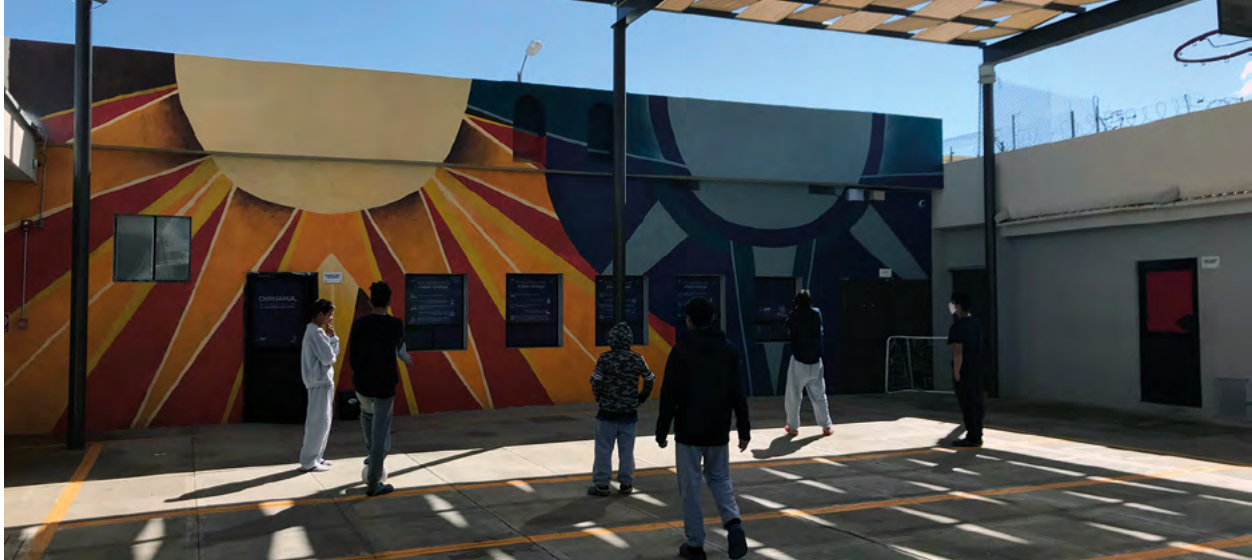
Boys play in the courtyard at the UNICEF supported open-door reception center in Chihuahua, Mexico.

and development. The American Academy of Pediatrics (AAP) has pointed to the negative physical and emotional symptoms among detained children, including high rates of post-traumatic stress disorder, anxiety, depression, suicidal ideation and other behavioral problems. According to the AAP, even brief detention in well-appointed facilities can cause psychological trauma and induce long-term risks for children. 44